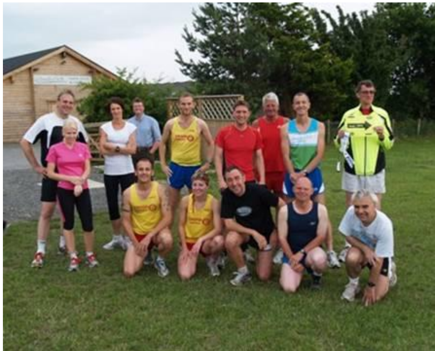
The family Crook Ac @ Stivvies Ramble

2 x MALE & 1 x FEMALE Northumberland Coastal Ticket 4 SALE! COME ON!!