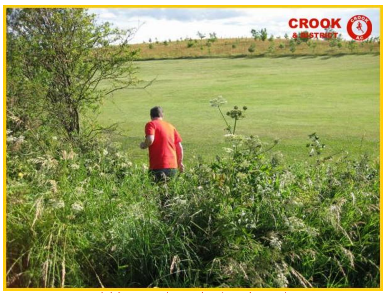
Phil Carter - Taking a shot from the rough