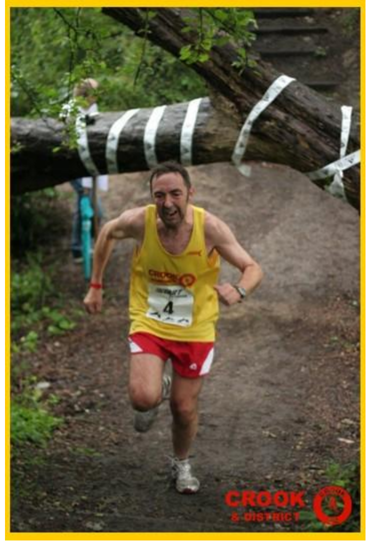
Clamber 2010 - Go on Smithy!